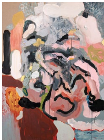
Hatem Imam, Glycine II . Oil on primed linen. 180x 240 cm.